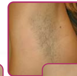
Hair Removal Before and 9 months after 3 treatments.