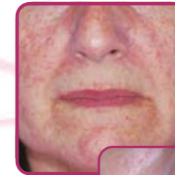
Photorejuvenation Before, and after 3 treatments.