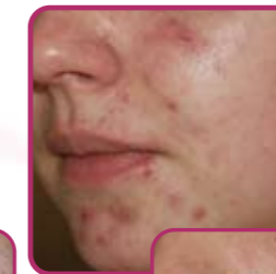
Active Acne Before, and after 3 treatments.