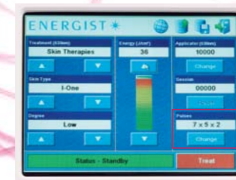
Intuitive Windows XP driven touch screen